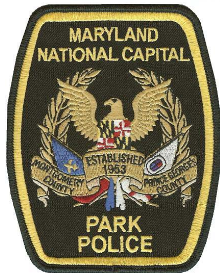
New Park Police Patch