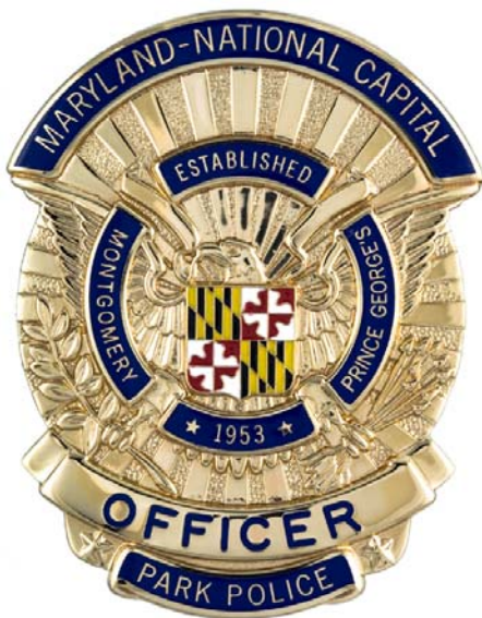
New Park Police Badge

At the time of its inception, the Park Police consisted of three officers, working six days a week. They were paid the princely sum of $3,000 a year with a $300 uniform allowance. These officers attended the Police Academy on their own time, while working as police officers. Since then, the Park Police has evolved into the second largest police force in both Montgomery and Prince George’s Counties. G