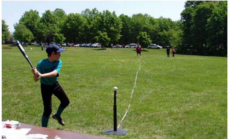
Participants try to “hit it out of the park.”