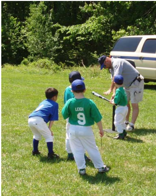
Future Little Leaguers receive some instruction.