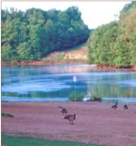
Shoreline vegetation killed by geese

Excess nutrients, caused by waterfowl droppings in ponds and lakes may result in water quality problems such as increased harmful bacteria and algal blooms that deplete oxygen from the water and kill fish.